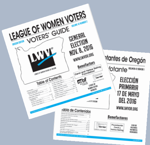
LWVOR produces Voters' Guides for statewide elections.