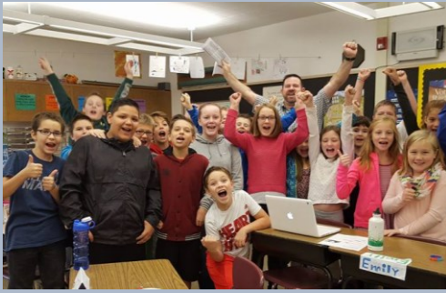
Students participate in the 2016 Oregon Student Mock Election.