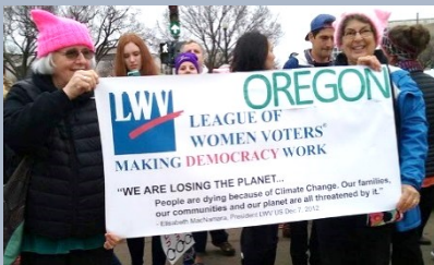
League members attend the 2017 Women's March on Washington.

LWVOR 1330 12 th St SE Suite 200 Salem, OR 97302 lwvor@lwvor.org 503-581-5722